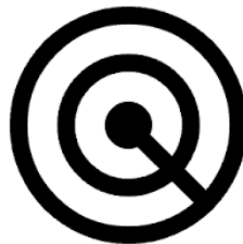
ra....ar ( d -a-t)