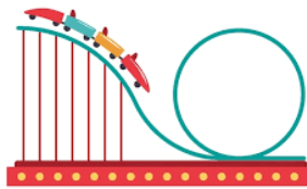
r....ller coaster (n-u- o )