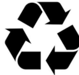
rec....cle (c- y -e)