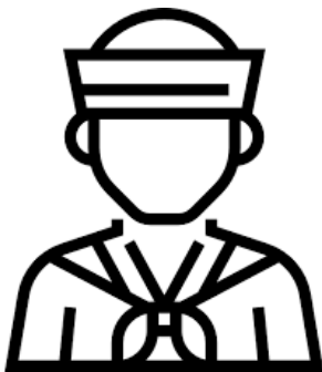
Sa...lor (a- i -e)