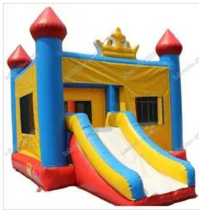
Bo....ncy castle (a- u -i)