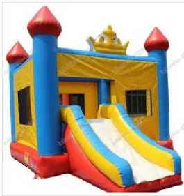
Bo....ncy castle (a-u-i)