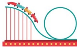
r....ller coaster (n-u-o)